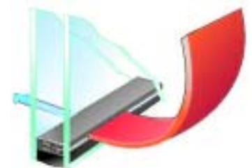
NO-Metal Super Spacer