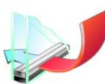
Full metal spacer

Patented all-foam design dramatically reduces condensation, delivering the clearest picture in Warm Edge Technology.