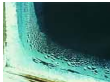
Window condensation can fuel mold growth.

Computer simulations conducted by Enermodal Engineering, a certified independent third party testing facility. Super Spacer® is a registered trademark of Edgetech IG Inc. Swiggle® is a registered trademark of TruSeal. Intercept® is a registered trademark of PPG Industries, Inc.